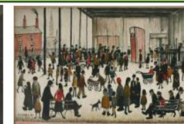
Punch and Judy 1943