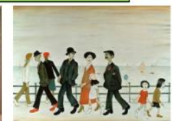
On the Promenade 1955