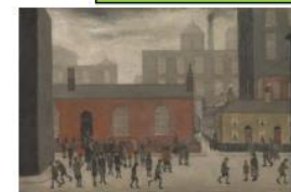
Coming out of School 1927