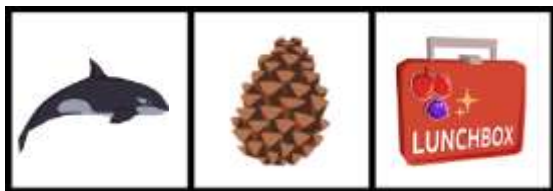
Alive Once alive Never alive